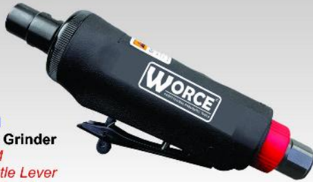
WX-53-52251 1/4" Mini Die Grinder - 25,000 RPM - Safety Throttle Lever - Built-in Comfort Grip