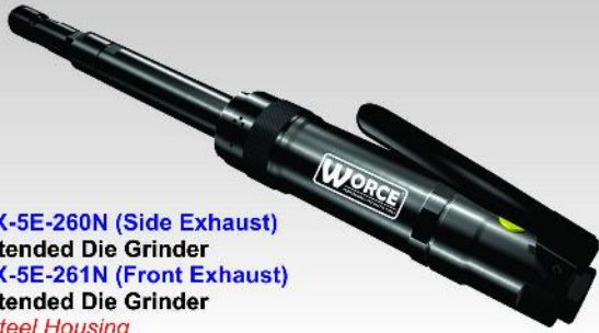
WX-5E-260N (Side Exhaust) Extended Die Grinder WX-5E-261N (Front Exhaust) Extended Die Grinder - Steel Housing