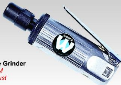
WX-552 1/4" Mini Die Grinder - 25,000 RPM - Front Exhaust