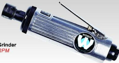
WX-512 1/4" Die Grinder - 22,000 RPM