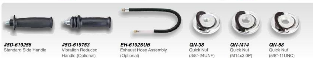
#5D-619256 Standard Side Handle