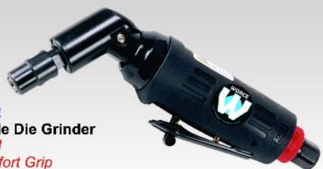
WX-55-52252 1/4" 115° Angle Die Grinder - 20,000 RPM - Built-in Comfort Grip - Safety Throttle Lever