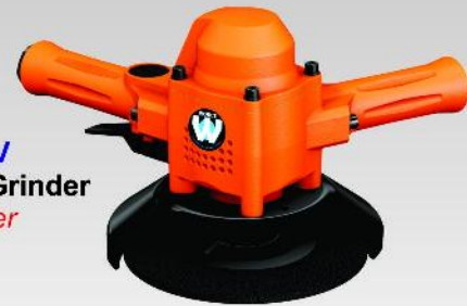
WX-5G-321V 7" Vertical Grinder - Safety Lever - 3.0 HP