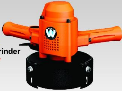
WX-5F-421C 6" Vertical Grinder - Safety Lever - 4.0 HP