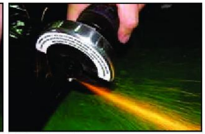
► Direction of Reverse