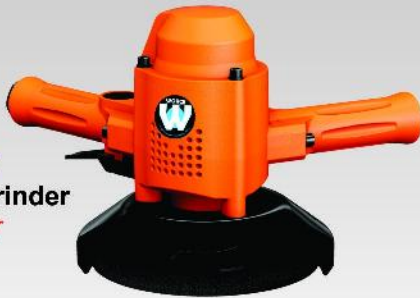
WX-5G-421V 7" Vertical Grinder - Safety Lever - 4.0 HP