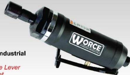
WX-50-5200 Die Grinder - Industrial - 22,000 RPM - Safety Throttle Lever - Erickson Collet