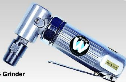
WX-562 1/4" Mini Angle Grinder - 22,000 RPM - Front Exhaust