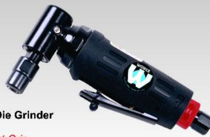
WX-52-52252 1/4" 90° Angle Die Grinder - 20,000 RPM - Built-in Comfort Grip - Safety Throttle Lever