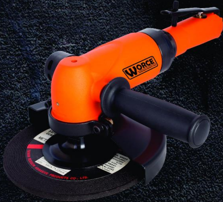
WX-5G-6423 7" Angle Grinder - 2.2 HP - 8,400 RPM