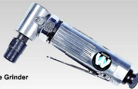
WX-522 1/4" Angle Die Grinder - 22,000 RPM - Full-Cage Gear Design