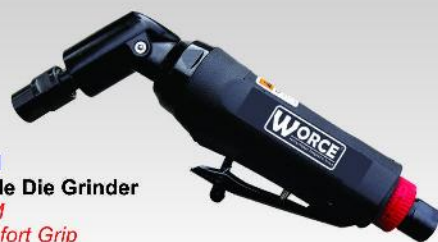
WX-55-52251 1/4" 115° Angle Die Grinder - 20,000 RPM - Built-in Comfort Grip - Safety Throttle Lever