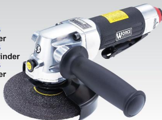
► 9 Position Adjustable Swivel Guard

WX-5B-6192AS 4" Angle Grinder WX-5C-6192AS 4-1/2" Angle Grinder WX-5D-6192AS 5" Angle Grinder