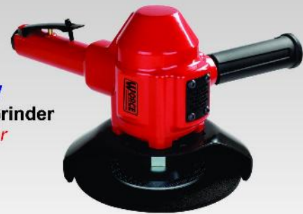
WX-5G-300V 7" Vertical Grinder - Safety Lever - 3.0 HP