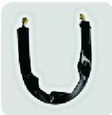
WX-45-405157-11SUB Exhaust Hose Assembly (Optional)