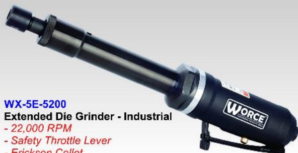
WX-5E-5200 Extended Die Grinder - Industrial - 22,000 RPM - Safety Throttle Lever - Erickson Collet