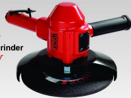
WX-5H-300V 9" Vertical Grinder - Safety Lever - 3.0 HP