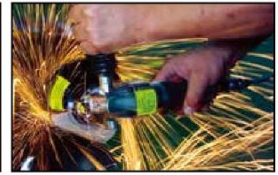
► Swivel Guard Adjustable

WX-5B-6192PS 4" Angle Grinder WX-5C-6192PS 4-1/2" Angle Grinder WX-5D-6192PS 5" Angle Grinder