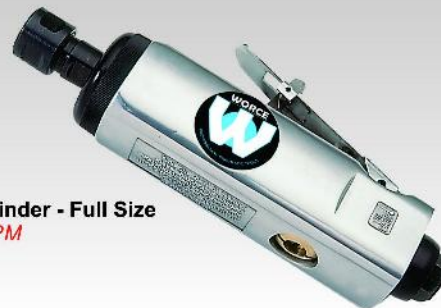
WX-582 1/4" Die Grinder - Full Size - 22,000 RPM