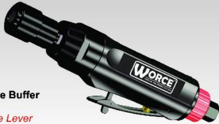
WX-6F-3011Z Low Speed Tire Buffer - 2,500 RPM - Safety Throttle Lever - Erickson Collet