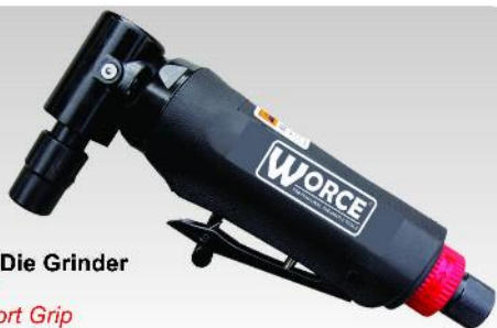
WX-52-52251 1/4" 90° Angle Die Grinder - 20,000 RPM - Built-in Comfort Grip - Safety Throttle Lever