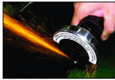
► Direction of Forward