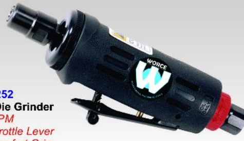
WX-53-52252 1/4" Mini Die Grinder - 25,000 RPM - Safety Throttle Lever - Built-in Comfort Grip