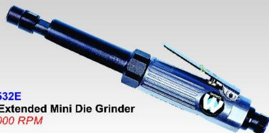
WX-532E 1/4" Extended Mini Die Grinder - 25,000 RPM