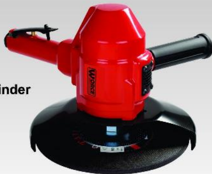
WX-5H-400V 9" Vertical Grinder - Safety Lever - 4.0 HP