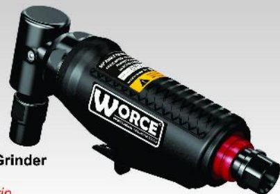
WX-52-5300 1/4" 90° Angle Die Grinder - 20,000 RPM - Built-in Comfort Grip - Safety Throttle Lever