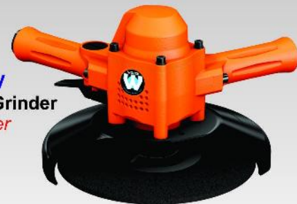
WX-5H-321V 9" Vertical Grinder - Safety Lever - 3.0 HP