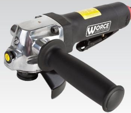
► 9 Position Adjustable Swivel Guard

WX-5B-6192PS 4" Angle Grinder WX-5C-6192PS 4-1/2" Angle Grinder WX-5D-6192PS 5" Angle Grinder