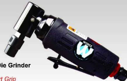
WX-52-5227 1/4" 90° Angle Die Grinder - 20,000 RPM - Built-in Comfort Grip - Safety Throttle Lever