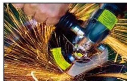
► Swivel Guard Adjustable

WX-5B-6192AS 4" Angle Grinder WX-5C-6192AS 4-1/2" Angle Grinder WX-5D-6192AS 5" Angle Grinder