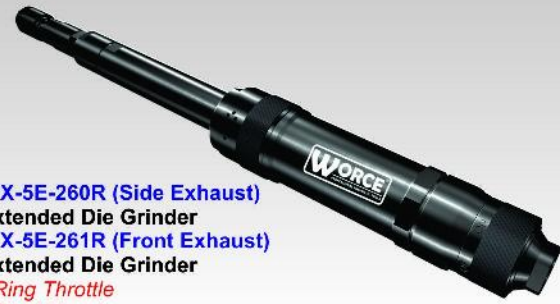
WX-5E-260R (Side Exhaust) Extended Die Grinder WX-5E-261R (Front Exhaust) Extended Die Grinder - Ring Throttle - Steel Housing