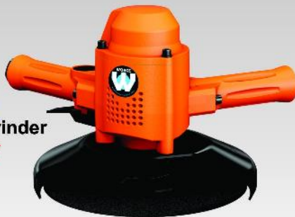
WX-5H-421V 9" Vertical Grinder - Safety Lever - 4.0 HP