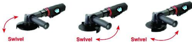
► 126° - 8 Position Adjustable Swivel Guard