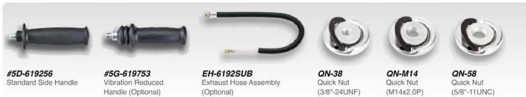
#5D-619256 Standard Side Handle