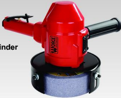
WX-5F-400C 6" Vertical Grinder - Safety Lever - 4.0 HP