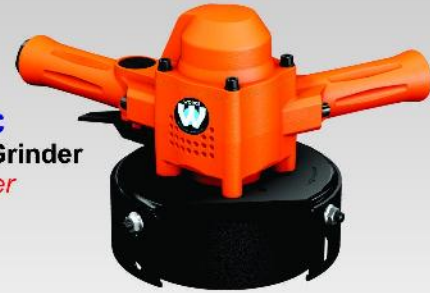
WX-5F-321C 6" Vertical Grinder - Safety Lever - 3.0 HP