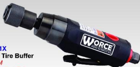
WX-6F-3011X Low Speed Tire Buffer - 2,500 RPM - Built-in Comfort Grip - Safety Throttle Lever