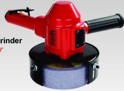
WX-5F-300C 6" Vertical Grinder - Safety Lever - 3.0 HP