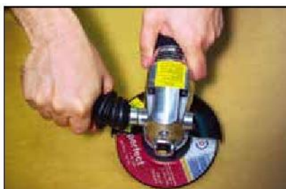
► Vibration Reduced Handle