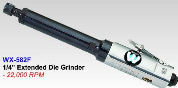
WX-582F 1/4" Extended Die Grinder - 22,000 RPM