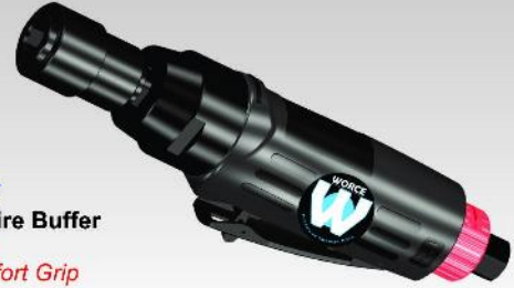
WX-6F-3011Y Low Speed Tire Buffer - 2,500 RPM - Built-in Comfort Grip - Safety Throttle Lever