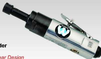
WX-585 1/4" Die Grinder - 4,500 RPM - Full-Cage Gear Design