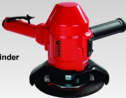
WX-5G-400V 7" Vertical Grinder - Safety Lever - 4.0 HP