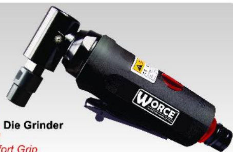
WX-52-5229 1/4" 90° Angle Die Grinder - 20,000 RPM - Built-in Comfort Grip - Safety Throttle Lever