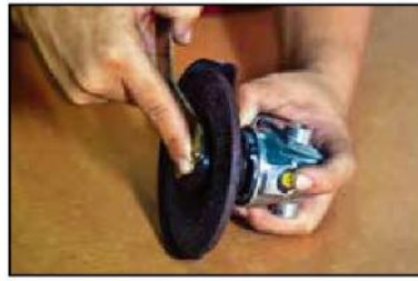
► Spindle Lock