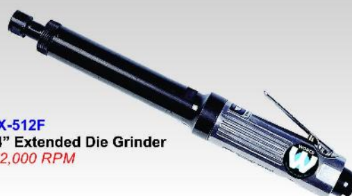
WX-512F 1/4" Extended Die Grinder - 22,000 RPM