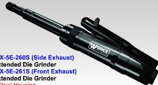
WX-5E-260S (Side Exhaust) Extended Die Grinder WX-5E-261S (Front Exhaust) Extended Die Grinder - Steel Housing