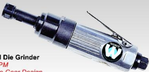
WX-545 1/4" Hand Die Grinder - 4,500 RPM - Full-Cage Gear Design