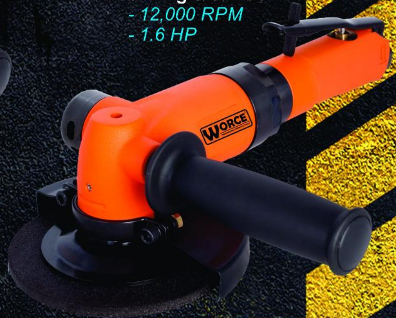
WX-5B-6422 4" Angle Grinder - 12,000 RPM - 1.6 HP