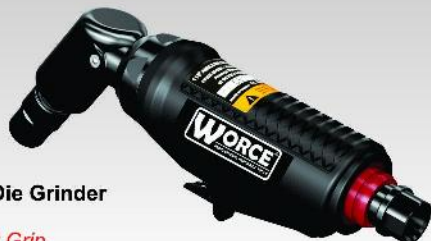
WX-55-5300 1/4" 115° Angle Die Grinder - 20,000 RPM - Built-in Comfort Grip - Safety Throttle Lever