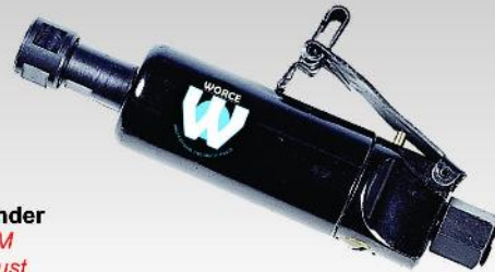
WX-501C 1/4" Die Grinder - 22,000 RPM - Front Exhaust - Built-in Comfort Grip