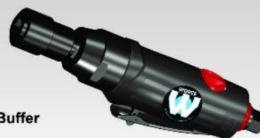
WX-6F-3011B Low Speed Tire Buffer - 2,500 RPM - Built-in Comfort Grip - Safety Throttle Lever