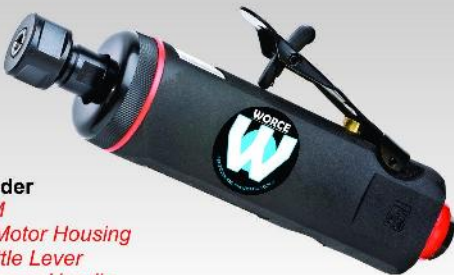
WX-572P 1/4" Die Grinder - 22,000 RPM - Composite Motor Housing - Safety Throttle Lever - Full Size Square Handle