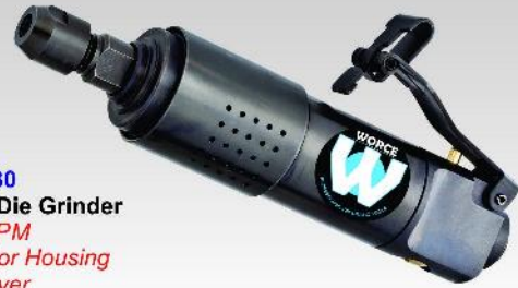
WX-53-5530 Industrial Die Grinder - 32,000 RPM - Steel Motor Housing - Safety Lever