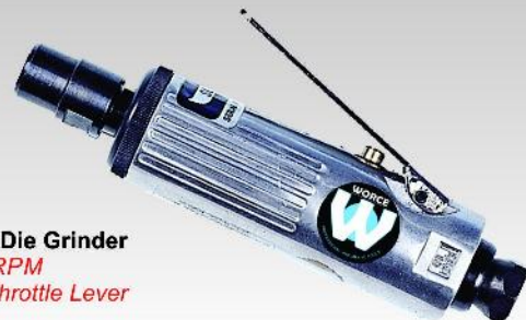
WX-532 1/4" Mini Die Grinder - 25,000 RPM - Safety Throttle Lever